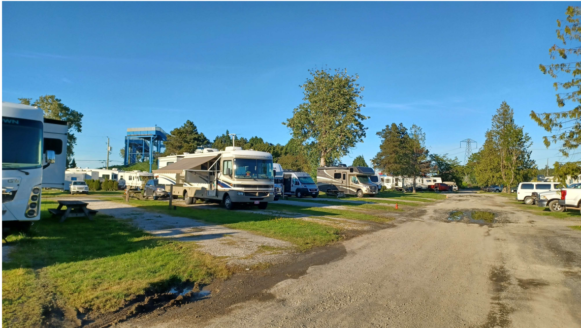
Tsawassen RV "Resort" Site 54

parking lot with power, water and sewer next door to an abandoned water slide park. And they call it a resort because of a little pool! What a joke.