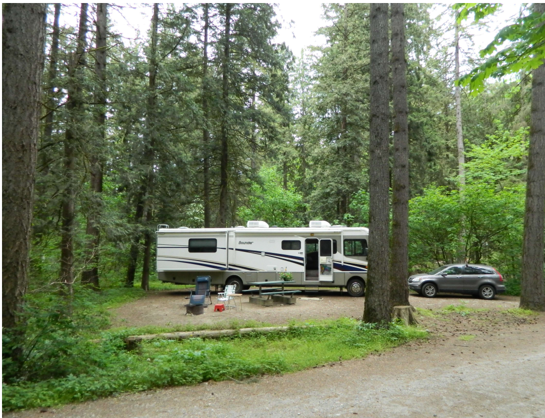
Coquihalla RV Park Site 68

Check-in was easy since we have a prepaid reservation and we settled into our home for the night by about 2:30pm. The office suggested the cheapest gas is Chilliwack. I used Gas Buddy to search and it is indeed cheaper than surrounding communities. I think it is because of the Costco gas bar in Chilliwack. Regardless, that's where we will fuel up tomorrow.