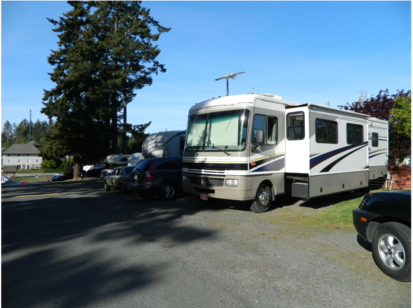
Fort Victoria RV Park Site 82

I ran a scan and the TV found 12 stations broadcasting over the air. None of them were showing the hockey game. iheart Radio app to the rescue again. The Oilers won 3-2 with a goal in the last minute. The series is now tied so it is effectively a best of 3.