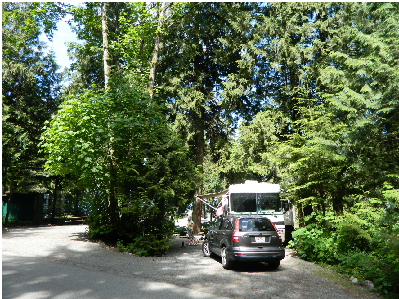
Living Forest Site 220

Next stop was Can Tire where, with the help of the young lady at the parts counter, I found my locking lock washer/nut. I paid for it with points. Woo hoo! They didn't have any Lexan and told me to go next door to Rona. At Rona I bought a small sheet of acrylic Lexan type stuff. Expensive!