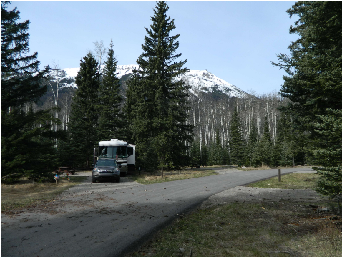
Whistler's Campground, Jasper Site 43F

We have a nice fire in the shadow of Marmot Mountain (?) and went in about 8:15 to listened to the Oilers blow a 4-1 lead and lose their first playoff game against the Canucks.