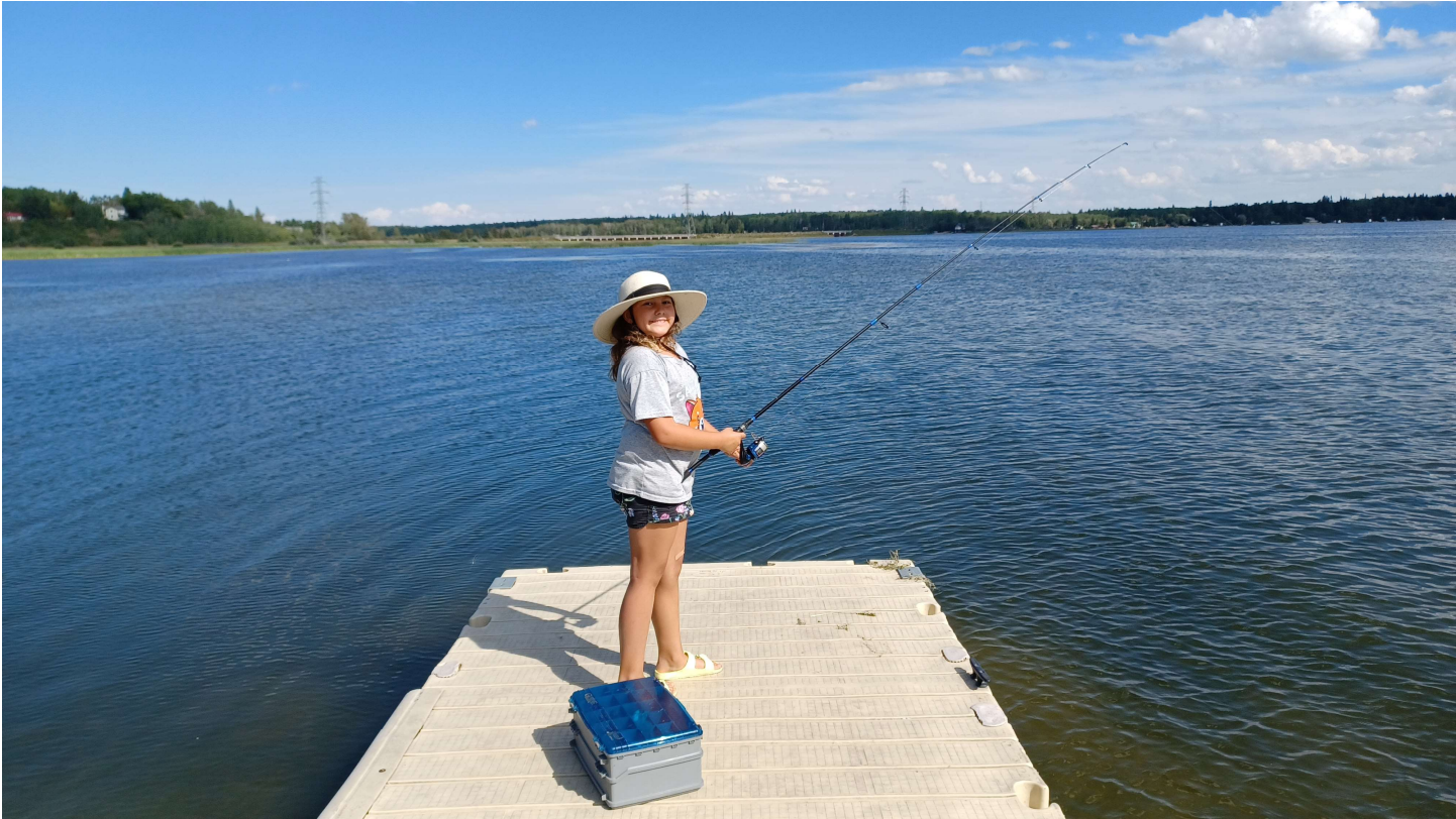
Fishing At Wabamun Waterfront