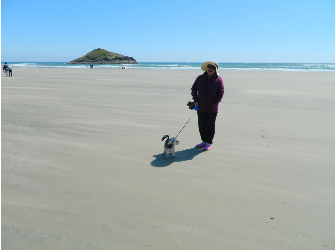
Long Beach on a Windy Day

We spend a couple of hours walking along meeting other dogs and people. We returned home for lunch about noon. Tofino and Ucluelet are on a peninsula at a 45 degree angle to the main body of Vancouver Island. There are several flat beaches of very firm sand separated by stretches of rock where the surf pounds itself into spray. Within the boundaries of the Pacific Rim National Reserve (like a national park but no fees) lies aptly named Long Beach, the biggest and best known.