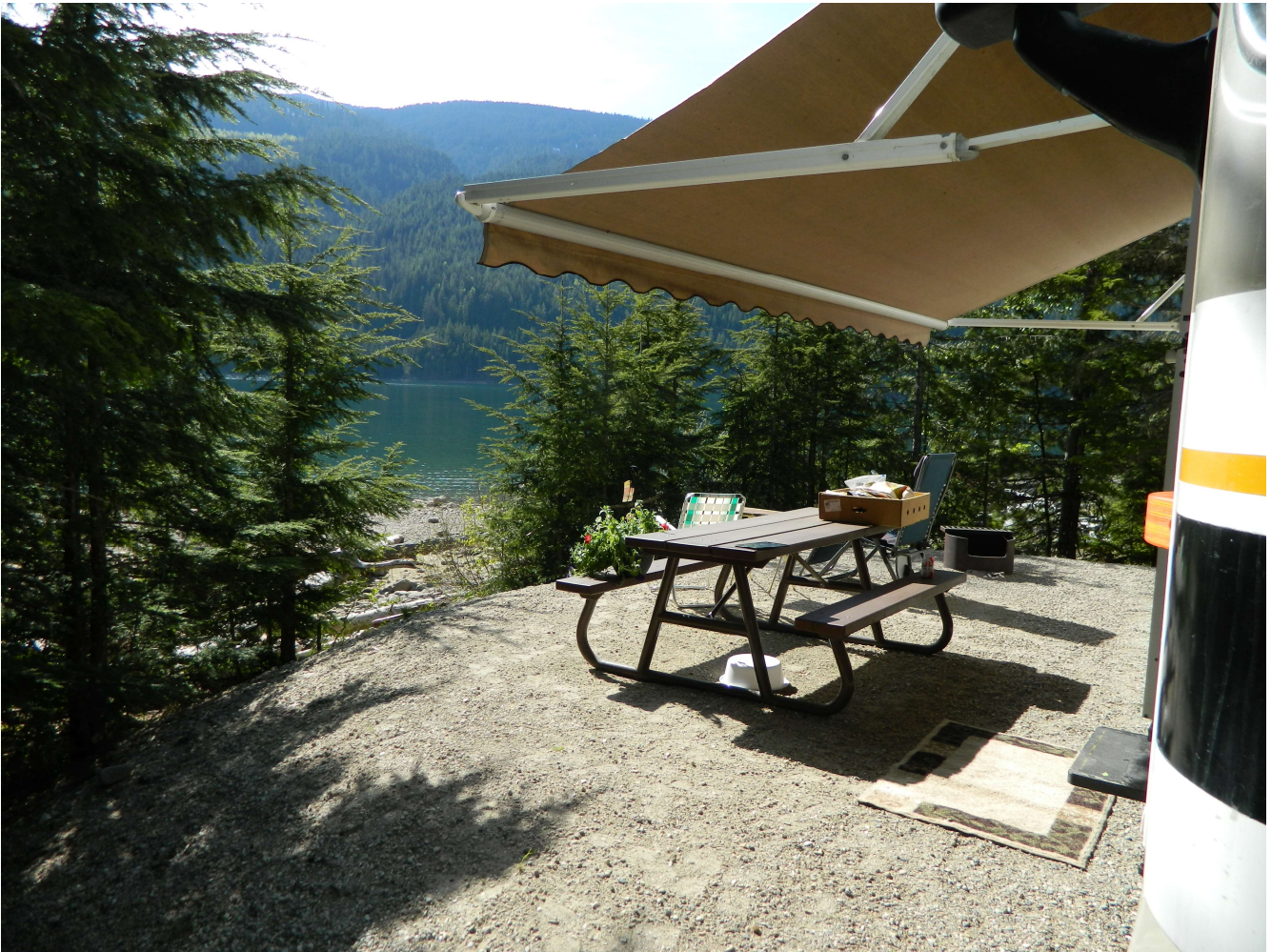
Martha Creek Prov Park Site 58

After dinner we had a nice campfire looking out over the lake. Tomorrow will be a busy day so we went to bed early.