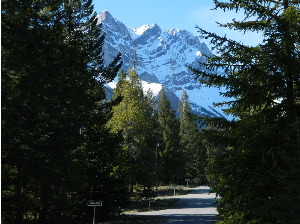
View at Tunnel Mountain Trailer Court

I got up around 8:00 to another beautiful sunny day. There is still lots of snow in the mountains all around us and the whole area is beautiful.