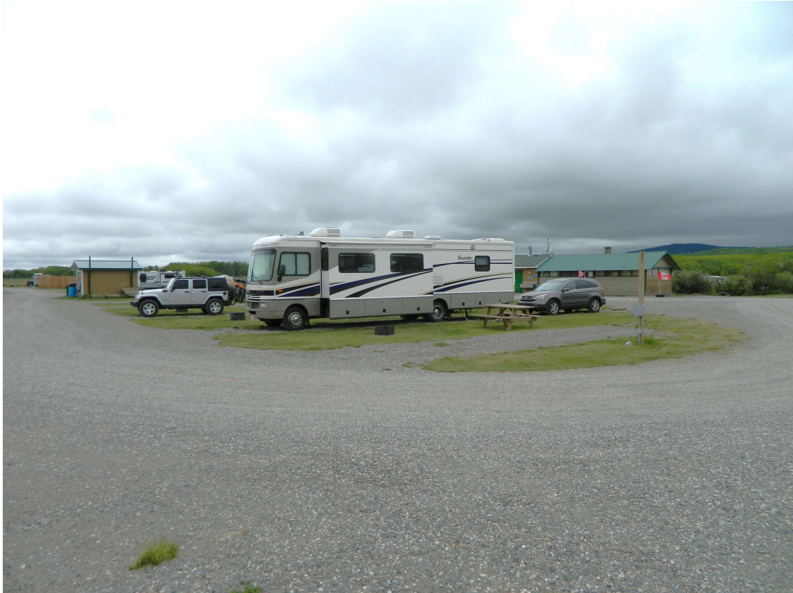
Crooked Creek Campground Site 21 near Waterton

The campground is beside the highway but there was almost no traffic after 8pm or so. Full service fairly spacious parking lot as these things often are. It is fine for a couple of nights. We didn't go out as we need a quiet afternoon/evening. No fire tonight because of the wind. The Oilers played the 4 th game of the Stanley Cup final and clobbered the Panthers 8-1 so there will be a game 5. We went to bed happy.