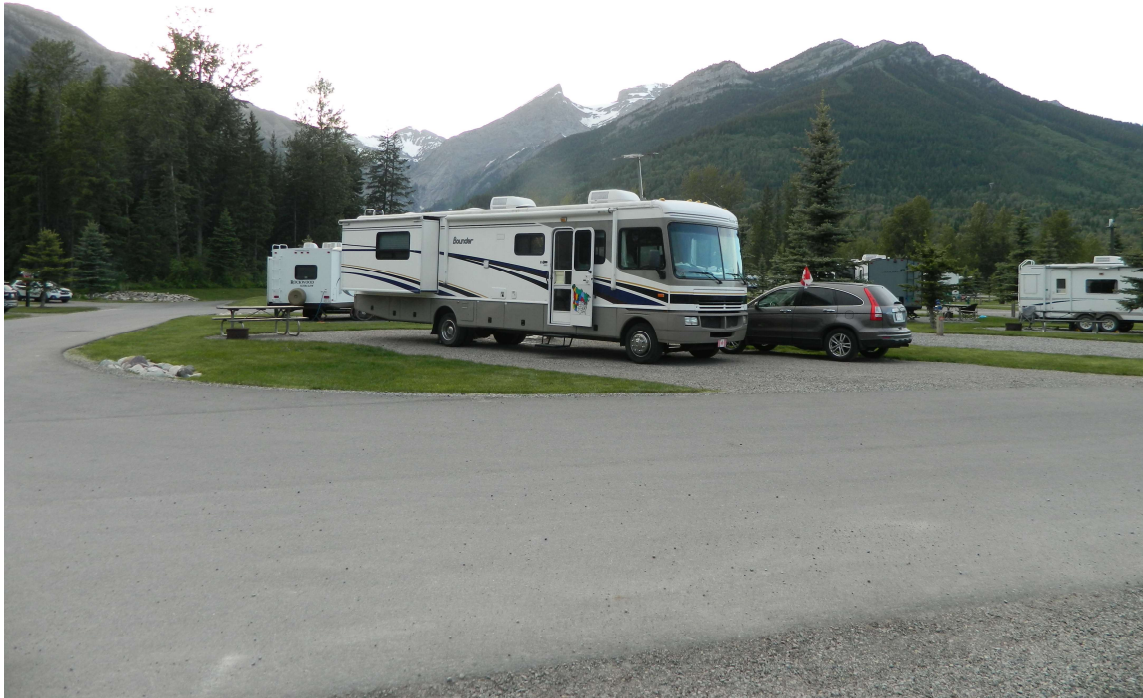
Fernie RV Resort site B10