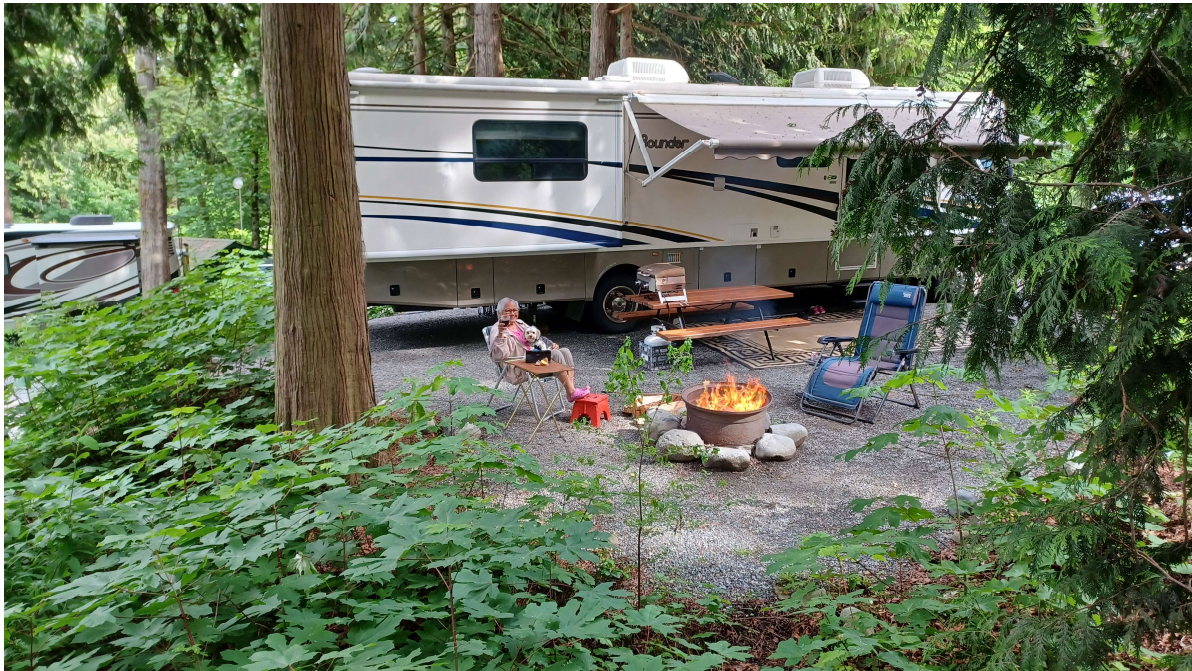
Living Forest Campfire

Back home we had a nice fire; the first since we arrived at Living Forest. I found some Ash hardwood floor scraps in the bottom of the wood storage compartment. Ash burns very nicely with no smoke, lots of heat, and nice big flames. Doesn't last long though.