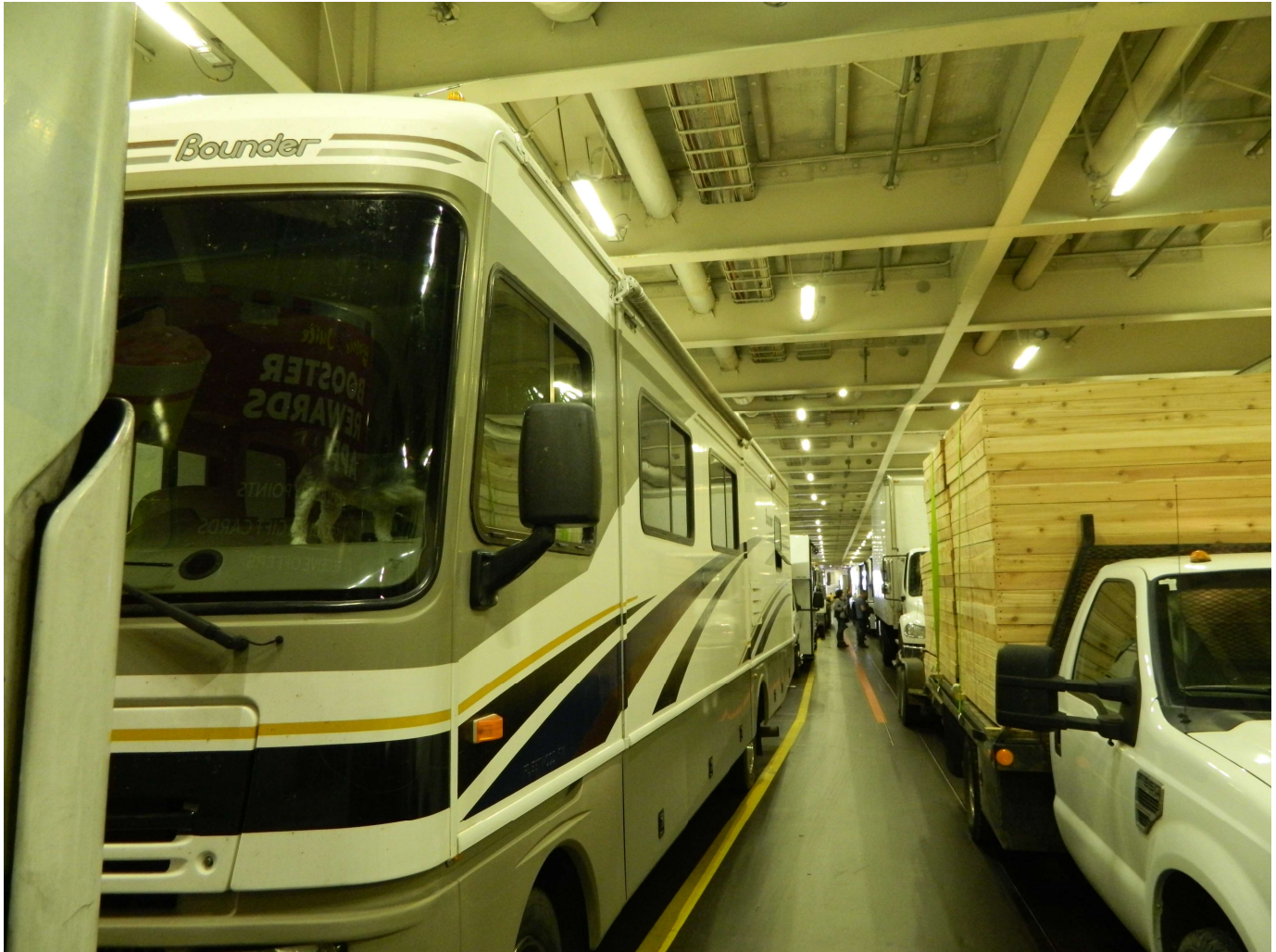
On Board the Ferry to Vancouver Island

Because we arrived early, we were nearly at the front to the line. First on means first off and we were #2 off the boat. The ferry trip was normal although Spike was not happy about being left alone for 90 minutes.