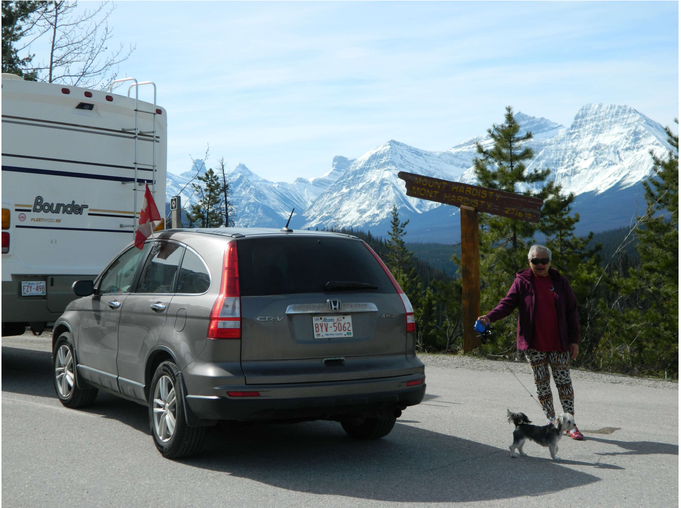
Hwy 93 Typical Viewpoint

We said goodbye to the elk and hit the road along Hwy 93, the Icefields Parkway. The scenery is spectacular. Every corner presents another mountain or lake. There are lots of viewpoints to stop and gawk if you are so inclined. Since we are playing tourist, we stopped several times.