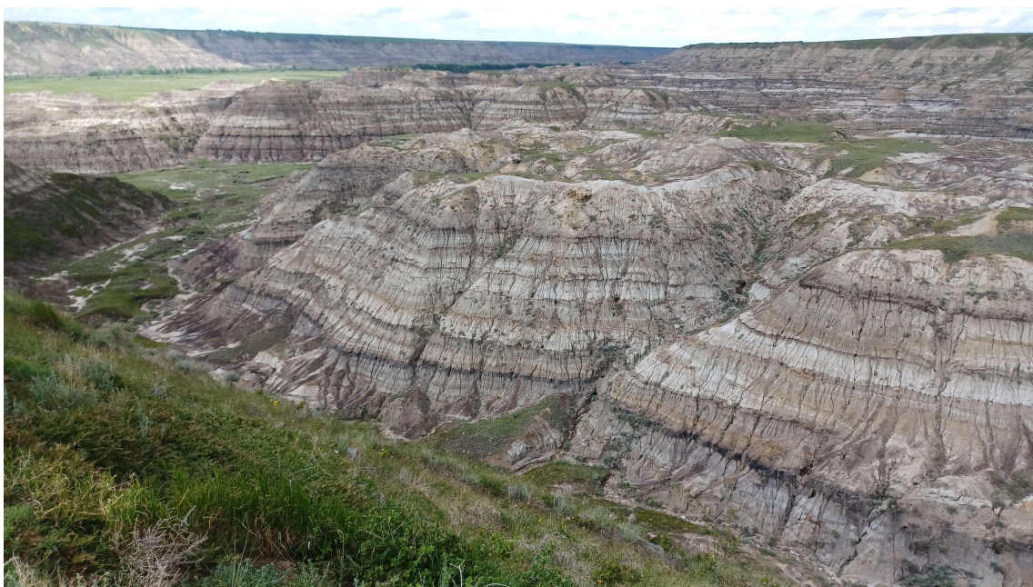
Horsethief Canyon, Drumheller