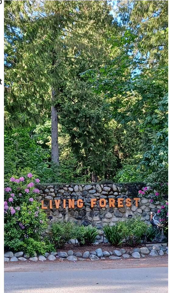
Living Forest Entrance

We got home to a lonely dog about 9:30, settled into our routines and went to bed at our usual times.