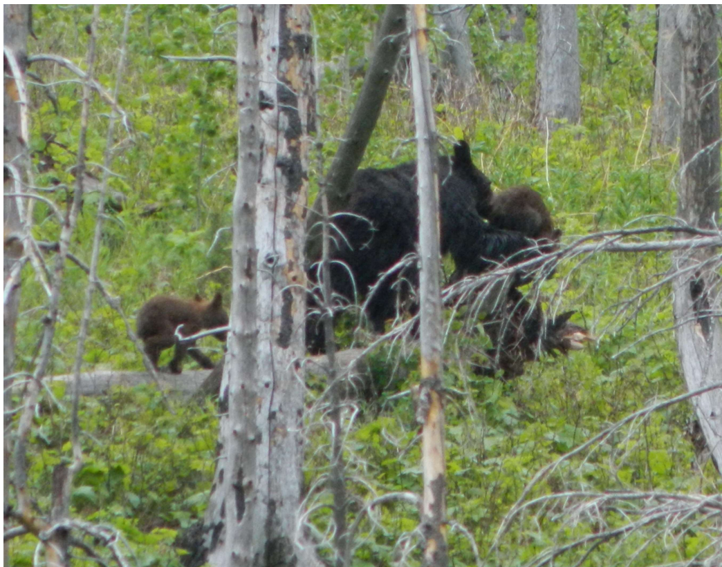
Momma Black Bear & Two Cubs