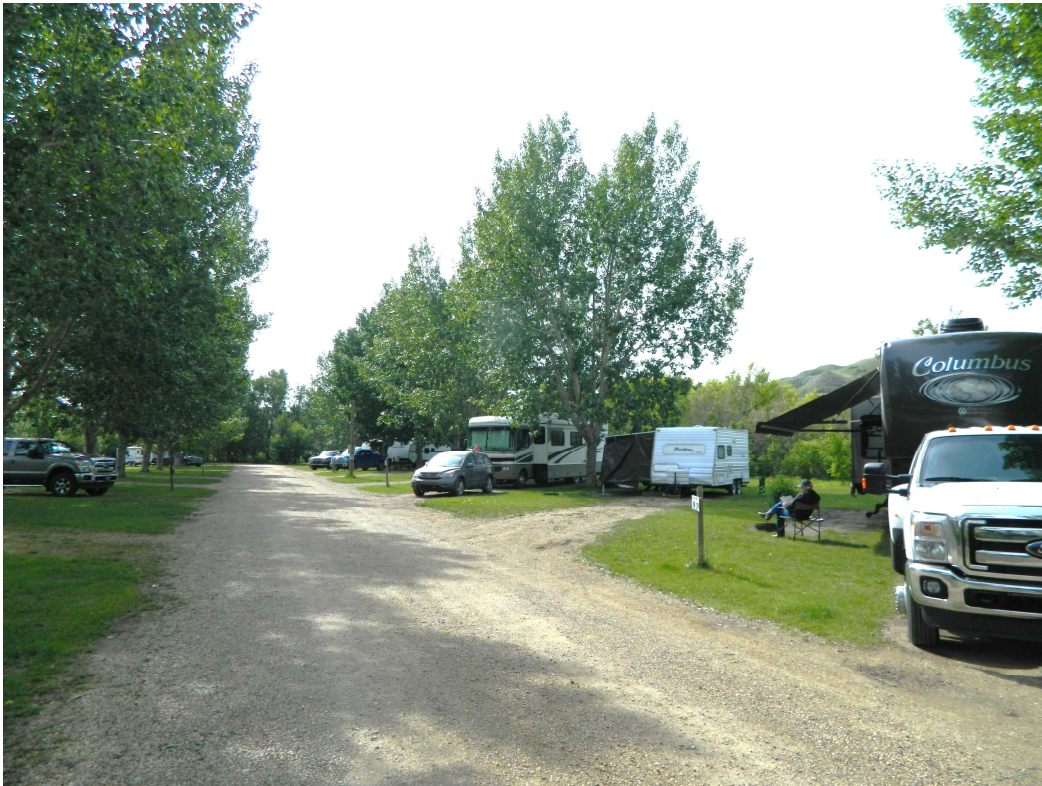
Hoodoo RV Park site 8

When I got up a little after 8:00am there was a couple of cm of fresh snow on the ground. On June 18 th ! Good grief. Today was a travel day covering about 350kms. The drive to Drumheller was uneventful and the GPS brought us right to the campground. We checked in and I took care of the setup chores. Easy in this case because we only need power and WiFi. We'll use most of our on-board water here then dump both tanks since we will be home tomorrow and we don't need to spend the extra fuel to haul liquids back to Morinville just to dump them there.