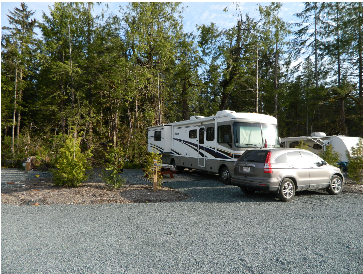
Tsawaak RV Resort in Tofino

After taking a wrong turn or two we finally found the RV park and I went to the office to register and pay the rest of our camping fee. They couldn't find my reservation so I showed them my copy. My copy said June 1 st – 4 th . Today is May 17, the Thursday before the May long weekend and they are fully booked. I asked for anything including no power. They have a no power site so I took it. Saved about $100 too. I asked to be put on standby in case of a cancellation so we'll see.