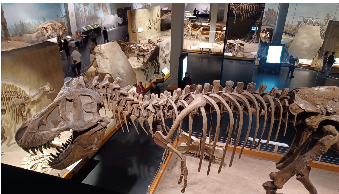
T-Rex at Tyrell Museum, Drumheller

Today was museum day. There was a large herd of schoolkids there but they were well behaved. It has been 25 years or more since we were here and the exhibits have been updated along with the storyboards. Some thinking has apparently changed as new discoveries are made—this is how science works. It took a couple of hours to see it all so it was $14 well spent.