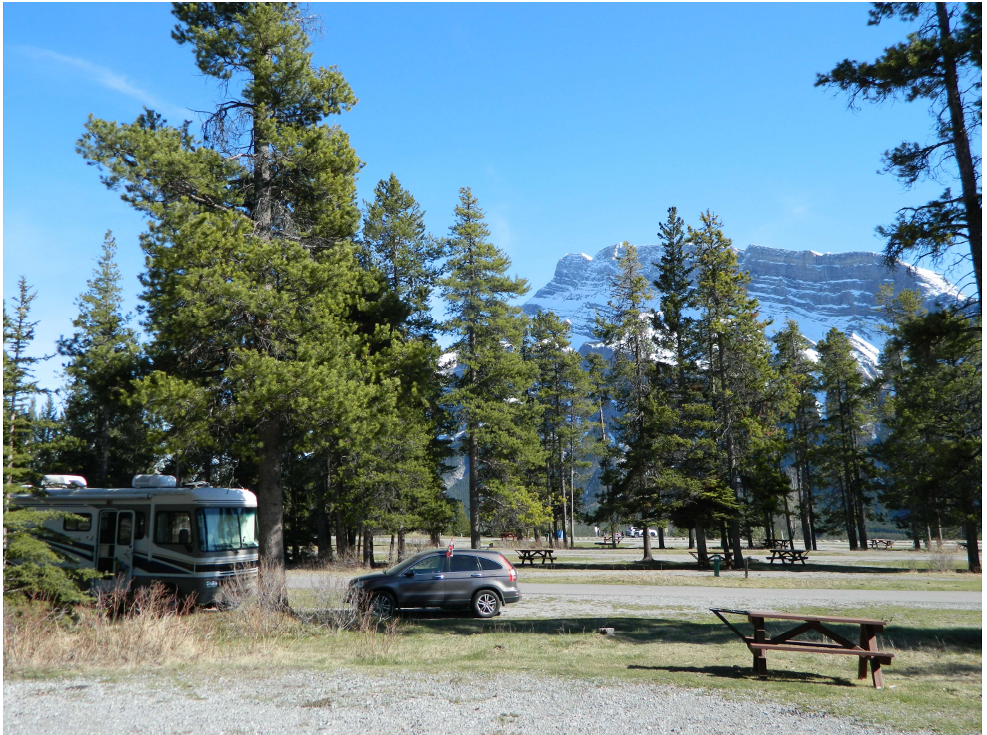
Tunnel Mountain Trailer Court Site 336

time to wander around town tomorrow. Today we went for a drive and saw the golf course, the Banff Springs Hotel, and toured downtown. We went by the local Petro-Canada gas station to find it is not suitable for a 53' RV plus toad. We will go into Canmore, about 20kms east, to fuel up before heading west into BC.