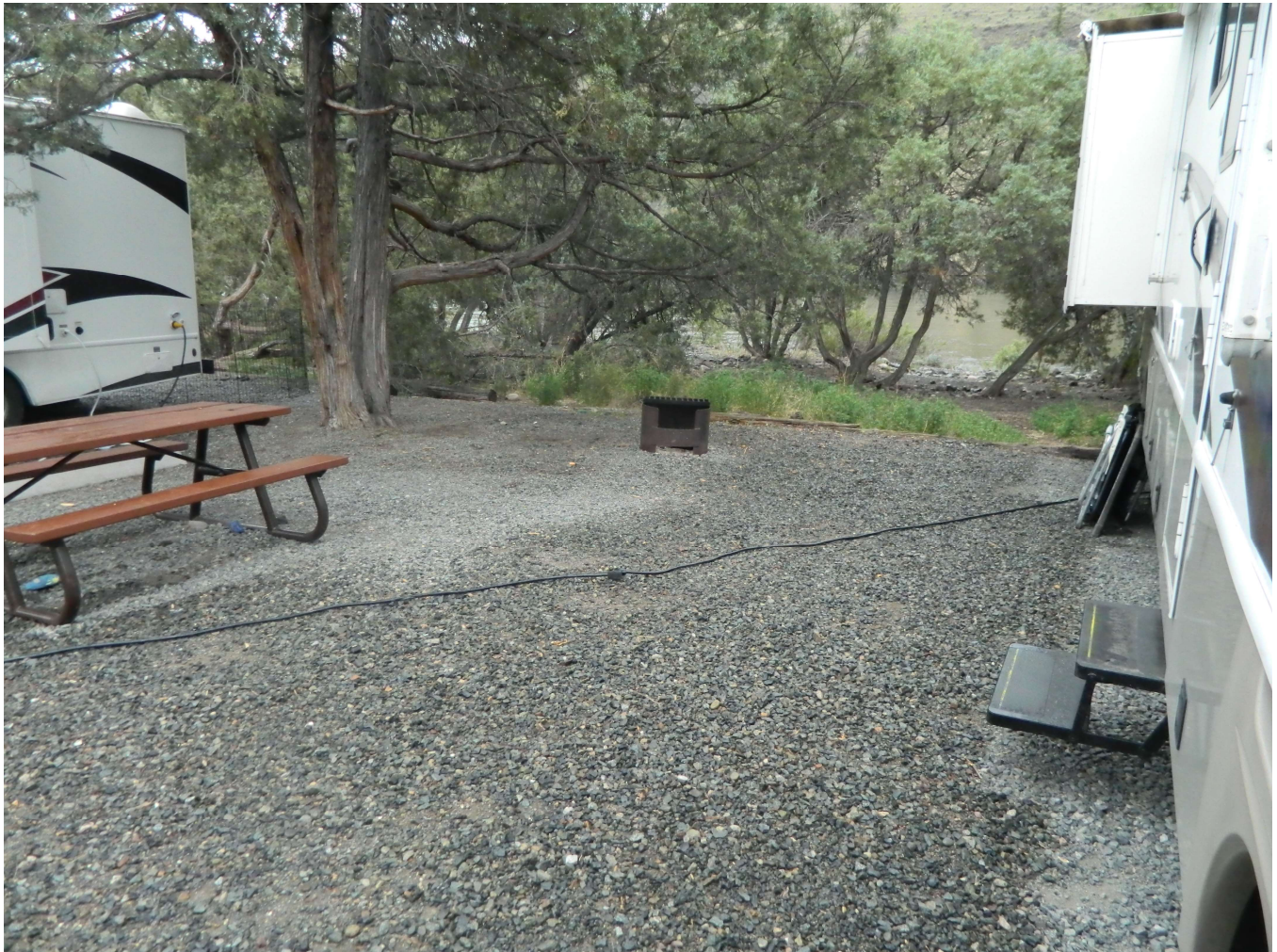
Juniper Beach Site 12

We came to Juniper Beach Provincial Park which is on the bank of the river we have been following since Salmon Arm. Number 12 is a back-in site on the river bank. A nice surprise was power and water. There are trees behind us, along the river bank, but nothing between sites which are pretty close together. No cell or TV service here.