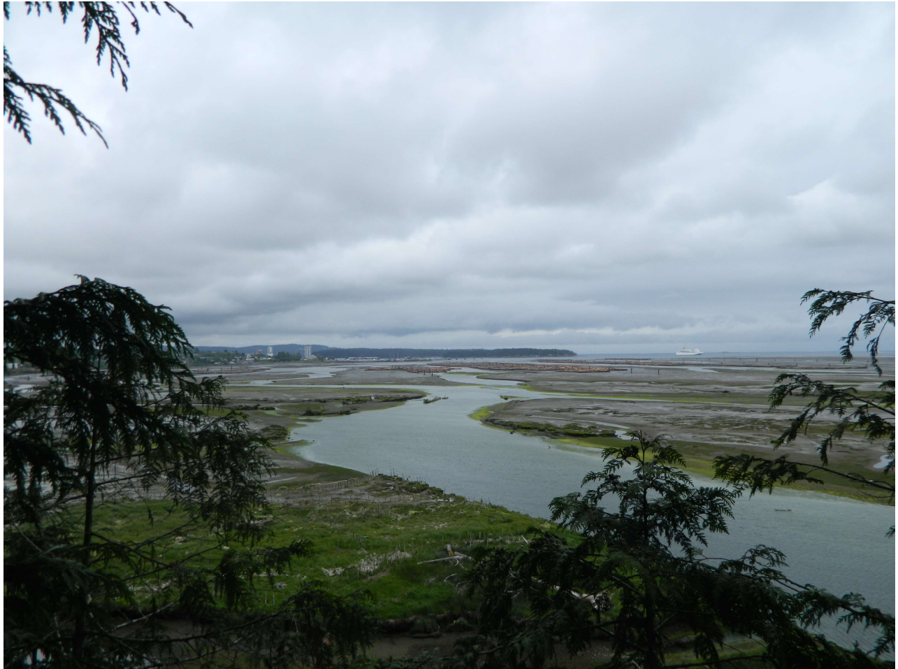
View of Downtown Nanaimo, River & Delta

building the Squamish LNG plant anchored nearby. It is being prepared here and will be docked in Squamish when the construction project gets underway later this year.