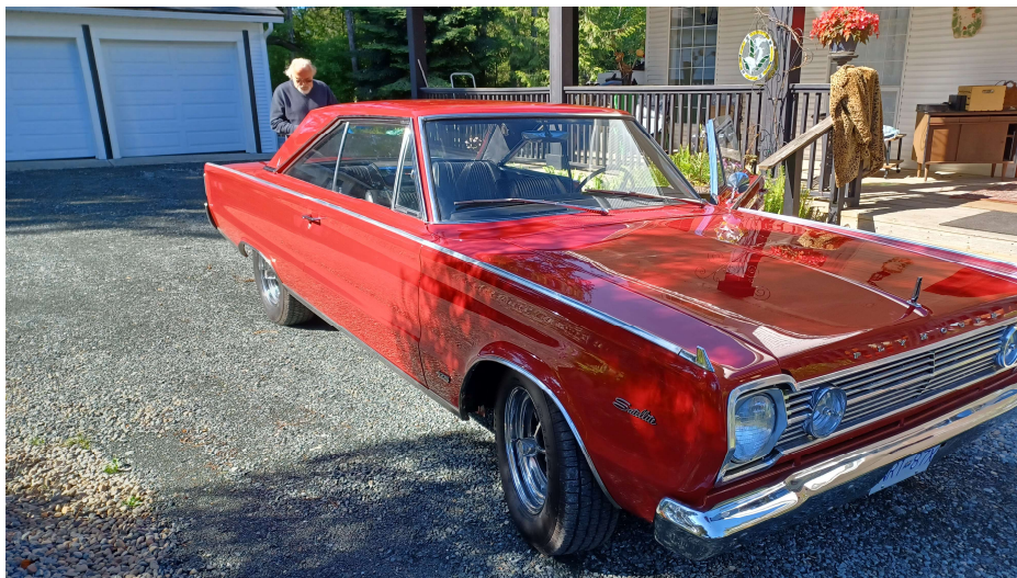
1966 Satellite Hemi 4 Speed Sold