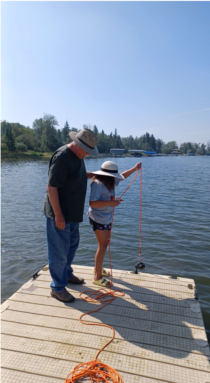
Magnet Fishing at Wabamun

Because we got up so late, we had brunch which is just fine. When we were finally ready to get out there and do something, Isla voted for magnet fishing so off we went to the boat launch. The water level is low again this year, down at least 2' from normal levels. I hope this is not the new normal.