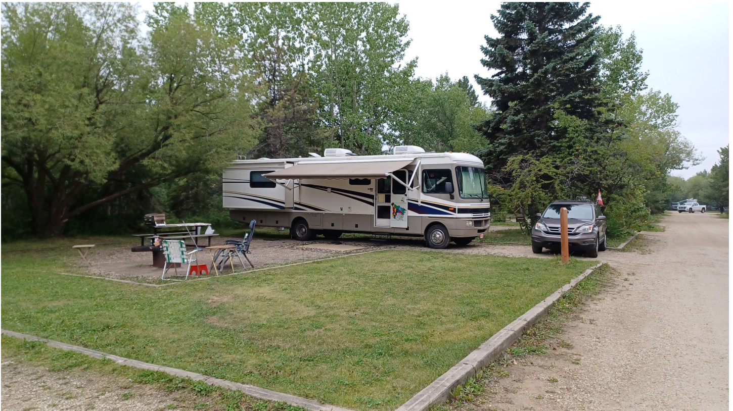
Wabamun Prov Park Site 112

Our first night was a fire, bbq dinner, then a movie with popcorn and bed by 10:30.