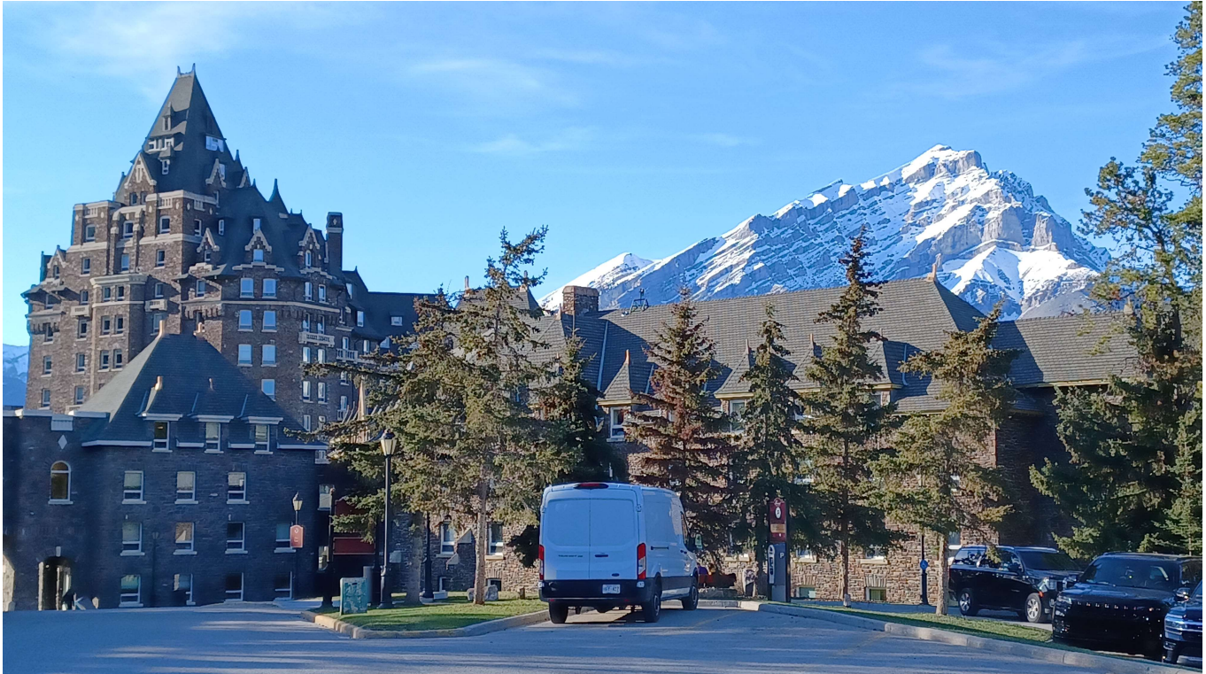
Banff Springs Hotel